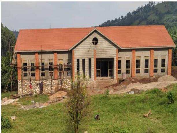
Library structure showing the front and main entrance.

We are progressing well toward finishing the library. We have finished most parts of the library structure including plastering. The remaining construction work involves painting, flooring, plumbing, and electrical installation. We expect to finish the library construction by July 2023, and we expect to officially open the library in December 2023.