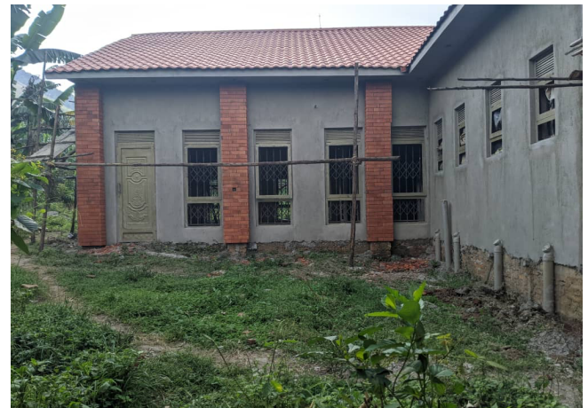
Back of the library showing complete plastering work.