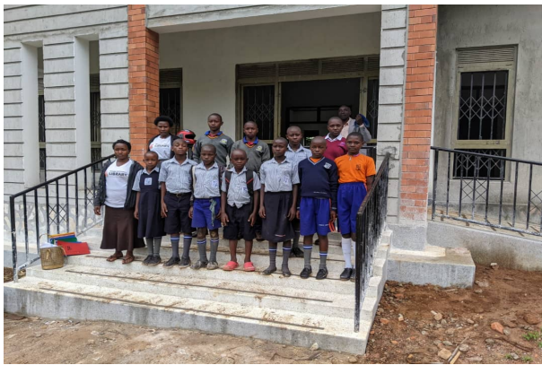
Figure 3: Elementary students on scholarship standing in front of the library before going to boarding school (May 2023).

The scholarship program (established last year, 2022) continues to provide needed support to children, offering them opportunities and hope for a brighter future. Currently, the scholarship initiative is benefitting 8 elementary students, consisting of 5 girls and 3 boys. These 8 kids are attending "Masheruka Primary School" as boarders. Additionally, there are 4 high school students, comprising 2 girls and 2 boys. The high school students are enrolled in separate schools, with the boys attending "St. Kagwa" High School and the girls attending "Kyeizooba" Girls School. The separation is because we mostly have single-sex high schools in Uganda. The scholarship fund covers tuition and other school expenses for the students, alleviating the financial burden that would otherwise hinder their education. For these children, the scholarship program has become a source of hope and a catalyst for dreams they once thought unattainable. We extend our heartfelt gratitude to individuals like you, whose unwavering goodwill and contributions continue to make these students' dreams a reality. Below are pictures showing the children who are currently benefiting from this life-changing scholarship fund.