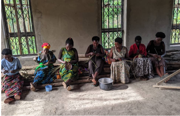
Fig 5: Community moms weaving baskets inside the unfinished library (February 2023).