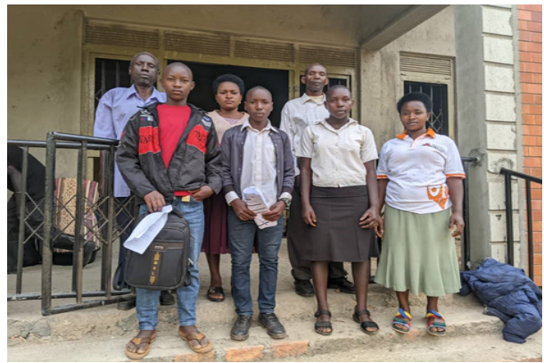
Figure 4: Highschool students on scholarship (and their parents) before they reported to boarding school (May 2023).