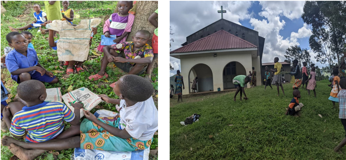
Fig 7: Pictures of students during the holiday reading program. On the left are students making crafts and on the right are students cleaning around the local church as part of community service.

As part of the holiday program, community work was integrated to instill a sense of social responsibility among the pupils. This involved engaging in cleaning activities at significant social service locations such as Health Centre 11, the library, and the local church. These endeavors not only encouraged teamwork and cooperation but also promoted community volunteering, contributing to the overall growth and development of the students. Below are pictures depicting holiday reading program activities.