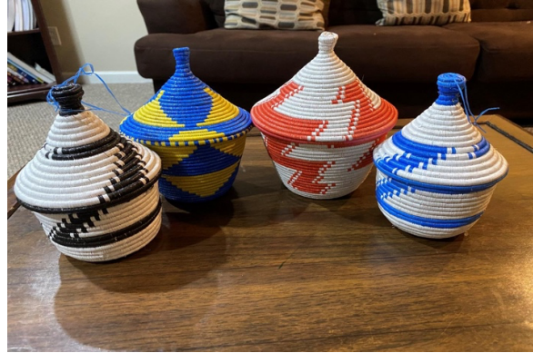
Fig 6: Some of the moms' baskets at Sarah's place in Louisville, Kentucky.