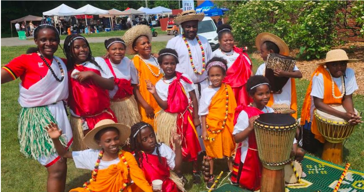
Fig 8: BEL kids Louisville posing for pictures after performing at the GlobalLou festival in Louisville, Kentucky. GlobalLou festival is held annually to celebrate cultural diversity in the city of Louisville.

ahead, BEL envisions expanding this program to reach a greater number of children, even extending the reach of East African culture within the United States. This may be achieved through music presentations, storytelling, dances, and other creative means, enabling the sharing of East African culture with people across the country.