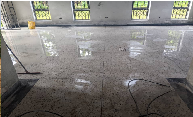
Figure 2: Interior of the library showing terrazzo floor