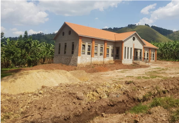
Figure1: The library from a distance.

The structure of the library is steadily taking shape, with construction nearing its completion. Our current focus is on exterior landscaping, while the remaining stages of construction include painting, security fencing, installation of window glasses, and electrical work. It is truly inspiring to witness the realization of our shared vision. Soon, this library will transform into a vibrant center of knowledge and learning, nurturing the minds of countless individuals within our Bwoga community. We anticipate finishing up all construction tasks by November, with an official launch planned for December this year. Below are pictures that offer glimpses into the library's magnificent structure and interior.